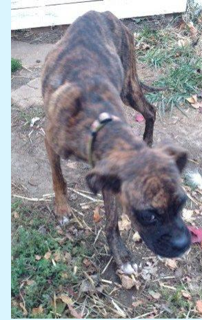
Pumpkin when he arrived - starving at 15 lbs...