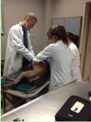
Hope examined by team of Vets at KS State