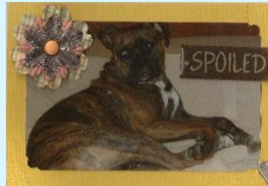
A year later in his new home - 58 lbs. and happy!