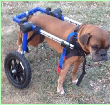
In her special cart