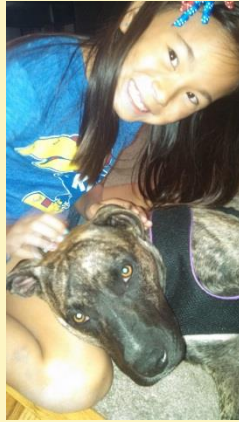
A little girl needed a protector...