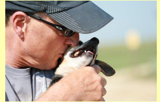
Banjo - Miracle Dog